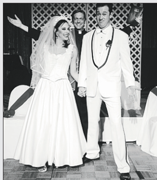
Tony 'n' Tina

Brought to you by VEGAS.com . Rooms, Shows, Tours and More! Book online now at www.VEGAS.com or call 1 866-9 VEGAS 9